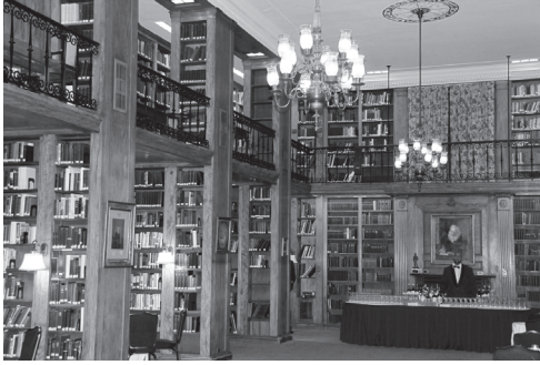
The Library, adjacent to the Lincoln Room, Union League Club