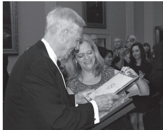
Our 2012 Great Defender of Life Dinner, honoring Senator James Buckley, took place on the same evening as the Al Smith Dinner. There was general agreement that Senator Buckley’s address bested the barb-fest uptown.

“The present confrontation over the contraception mandate grew out of the fact that the 2008 presidential election put people with post-Christian social views into key position in the federal government. The agenda of these public officials includes “reproductive freedom,” “marriage equality,” euthanasia, condoms for kids, eugenic rationing of healthcare, and who knows what else. It turns out, then, that a government big enough to enact social programs favored by the Catholic Church is big enough to openly war against centuries of Church teaching.”