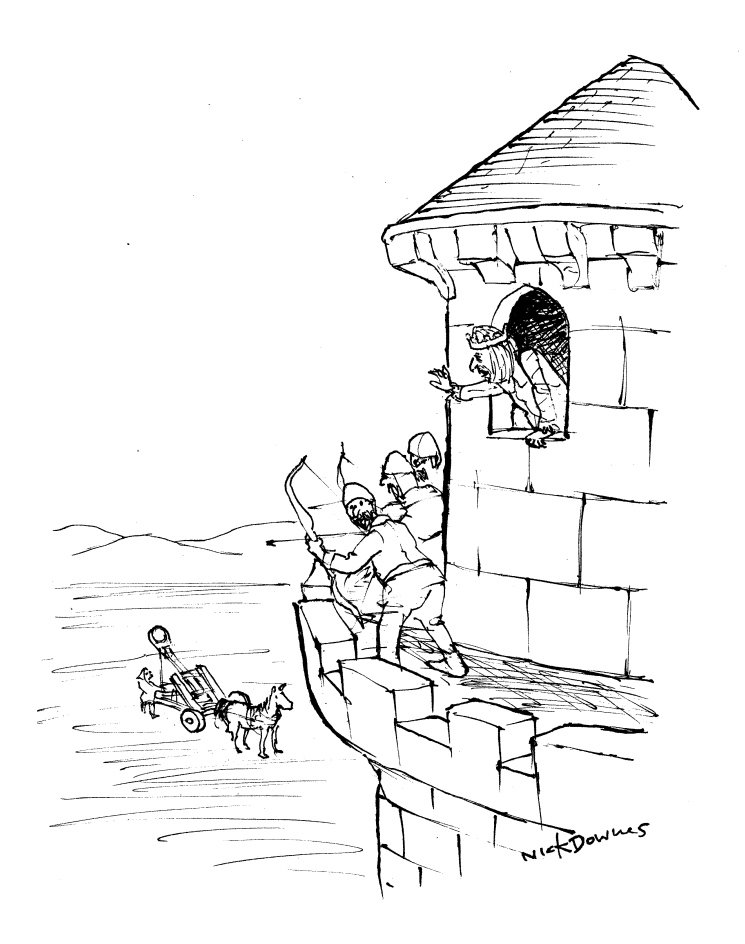
"Relax—it's just the pizza guy."